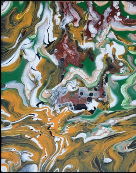
Geologic Thin Section, A. Saindon 2020